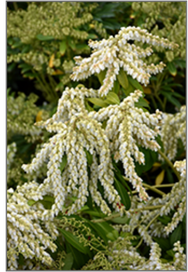
Temple Bells Japanese Pieris flowers