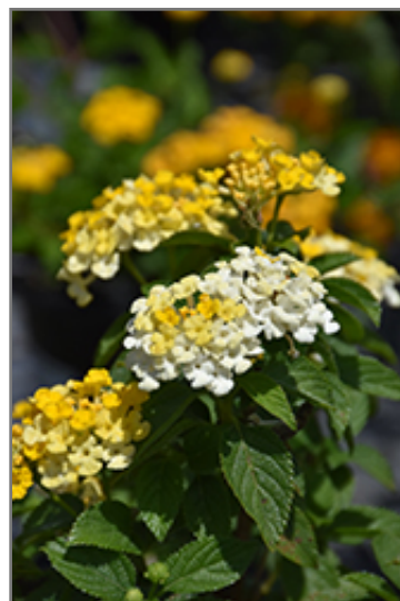
Bandana Lemon Zest Lantana flowers