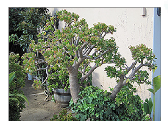
Jade Plant

This is a relatively low maintenance shrub, and can be pruned at anytime. It is a good choice for attracting bees and butterflies to your yard, but is not particularly attractive to deer who tend to leave it alone in favor of tastier treats. It has no significant negative characteristics.