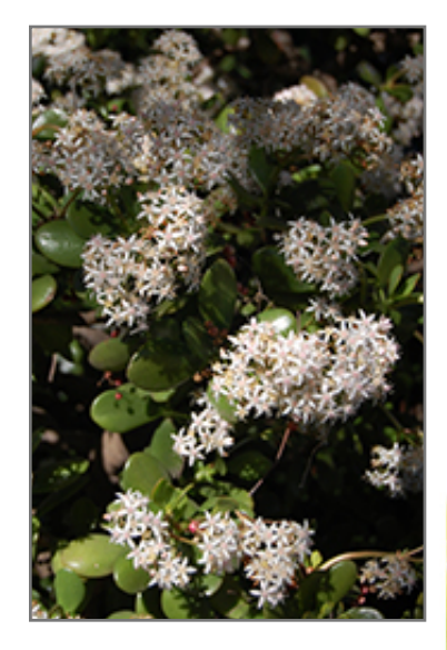
Jade Plant flowers