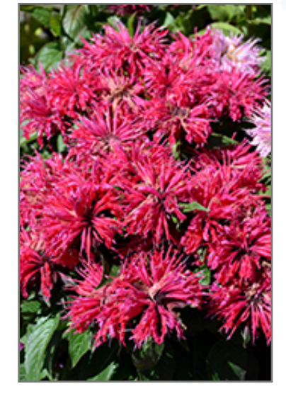
Cherry Pops Beebalm flowers