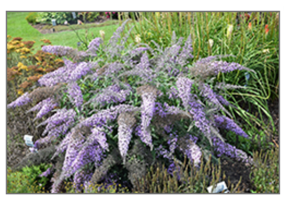
Grand Cascade Butterfly Bush in bloom

Height: 6 feet Spread: 8 feet Sunlight: O Hardiness Zone: 4b Other Names: Summer Lilac Group/Class: Cascade Collection