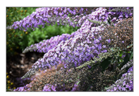
Grand Cascade Butterfly Bush flowers

Grand Cascade Butterfly Bush features showy panicles of fragrant lavender flowers with purple overtones at the ends of the branches from mid summer to early fall. The flowers are excellent for cutting. It has grayish green deciduous foliage. The narrow leaves do not develop any appreciable fall color.