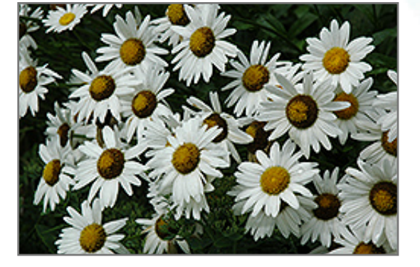
Alaska Shasta Daisy flowers