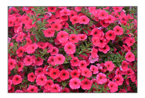
Supertunia Vista Paradise Petunia flowers