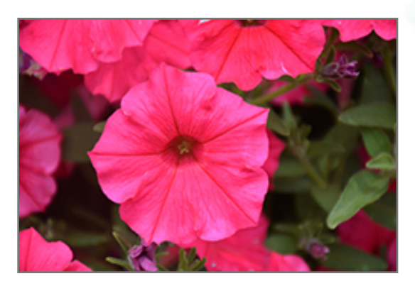
Supertunia Vista Paradise Petunia flowers

Supertunia Vista Paradise Petunia is recommended for the following landscape applications;