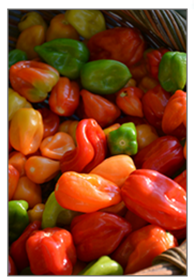
Habanero Pepper fruit

An extremely hot selection that can reach upwards of 8 feet; performs wonderfully in patio containers and gardens; strong, upright stems produce small, brightly colored fruit; delicious when used for hot sauces, drying, salsas and pickling