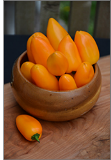
Lunchbox Yellow Sweet Pepper fruit