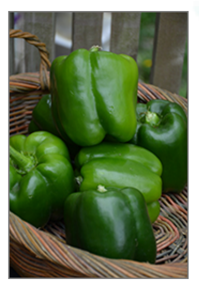
California Wonder Sweet Pepper fruit

This lovely heirloom variety produces 4" bell peppers that ripen to bright red; these sweet and crisp peppers are great stuffed, roasted, grilled or on vegetable trays; tall, strong plants are wonderful in patio containers or gardens