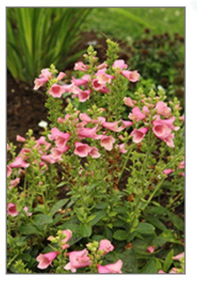
Flamingo Tender Foxglove in bloom