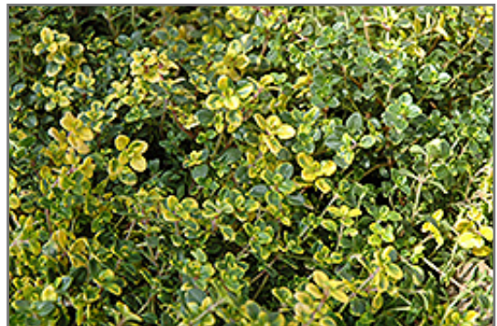
Doone Valley Thyme