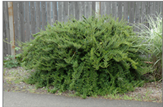
Box Honeysuckle

Box Honeysuckle is recommended for the following landscape applications;