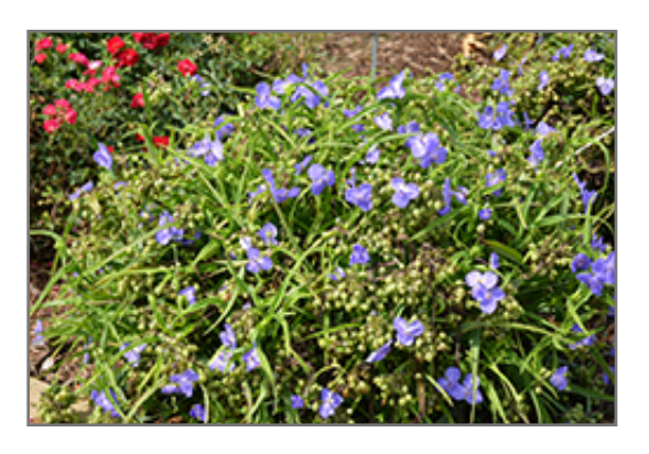
Amethyst Kiss Spiderwort in bloom