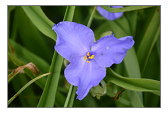
Amethyst Kiss Spiderwort flowers

Amethyst Kiss Spiderwort is recommended for the following landscape applications;