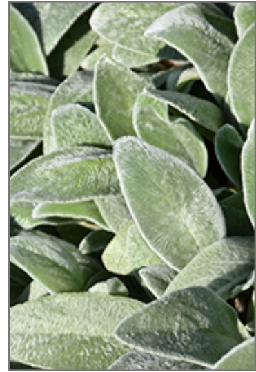
Lamb's Ears foliage

Lamb's Ears is recommended for the following landscape applications;