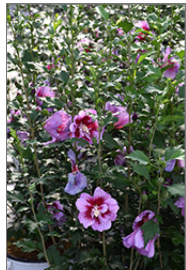
Purple Pillar Rose of Sharon flowers