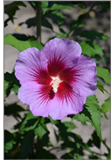
Purple Pillar Rose of Sharon flowers