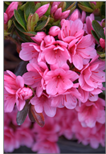
Coral Bells Azalea flowers