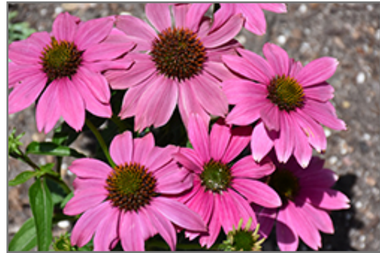
PowWow Wild Berry Coneflower flowers