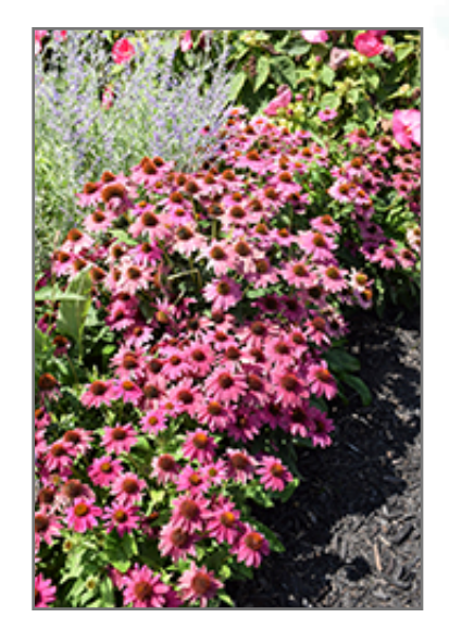
PowWow Wild Berry Coneflower in bloom

This plant should only be grown in full sunlight. It is very adaptable to both dry and moist locations, and should do just fine under typical garden conditions. It is considered to be drought-tolerant, and thus makes an ideal choice for a low-water garden or xeriscape application. It is not particular as to soil type or pH. It is highly tolerant of urban pollution and will even thrive in inner city environments. This is a selection of a native North American species. It can be propagated by division; however, as a cultivated variety, be aware that it may be subject to certain restrictions or prohibitions on propagation.