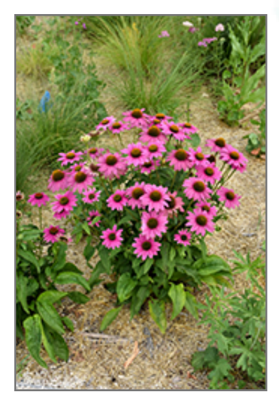
PowWow Wild Berry Coneflower in bloom

This is a relatively low maintenance plant, and is best cleaned up in early spring before it resumes active growth for the season. It is a good choice for attracting birds and butterflies to your yard, but is not particularly attractive to deer who tend to leave it alone in favor of tastier treats. It has no significant negative characteristics.