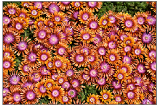
Fire Spinner Ice Plant in bloom

Fire Spinner Ice Plant is recommended for the following landscape applications;