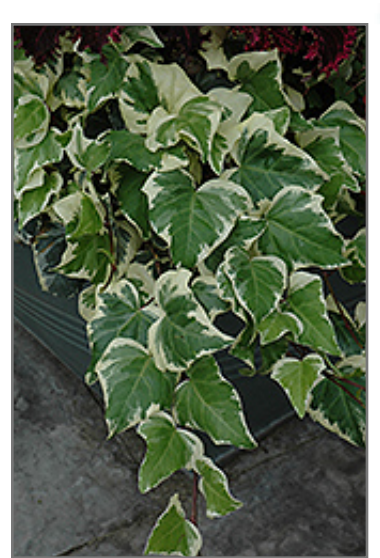
Gloire de Marengo Ivy foliage