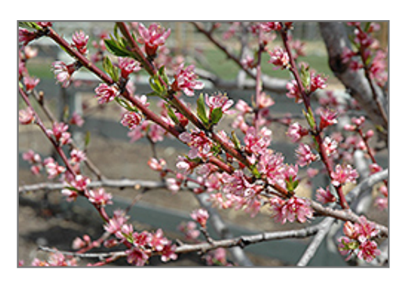
Redhaven Peach flowers