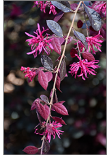
Purple Diamond Fringeflower flowers

Purple Diamond Fringeflower is recommended for the following landscape applications;