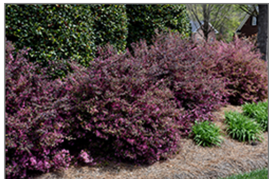
Purple Diamond Fringeflower in bloom