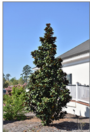
Teddy Bear Magnolia