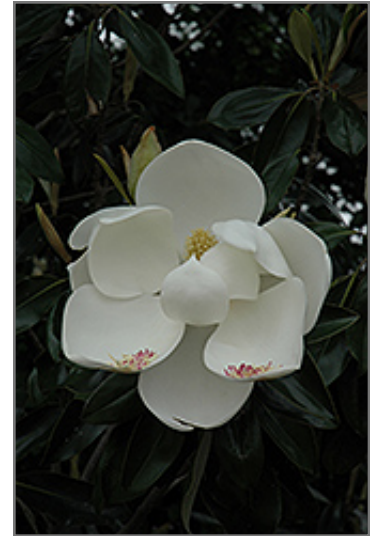
Teddy Bear Magnolia flowers