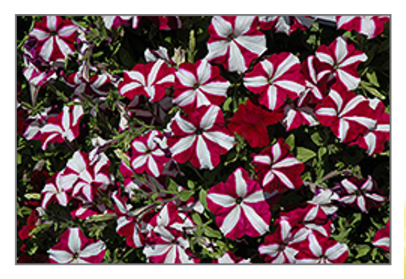
Easy Wave Burgundy Star Petunia flowers

This plant will require occasional maintenance and upkeep. Trim off the flower heads after they fade and die to encourage more blooms late into the season. It is a good choice for attracting bees and hummingbirds to your yard, but is not particularly attractive to deer who tend to leave it alone in favor of tastier treats. It has no significant negative characteristics.