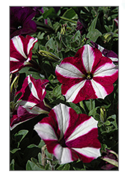
Easy Wave Burgundy Star Petunia flowers

Easy Wave Burgundy Star Petunia is a dense herbaceous annual with a trailing habit of growth, eventually spilling over the edges of hanging baskets and containers. Its medium texture blends into the garden, but can always be balanced by a couple of finer or coarser plants for an effective composition.