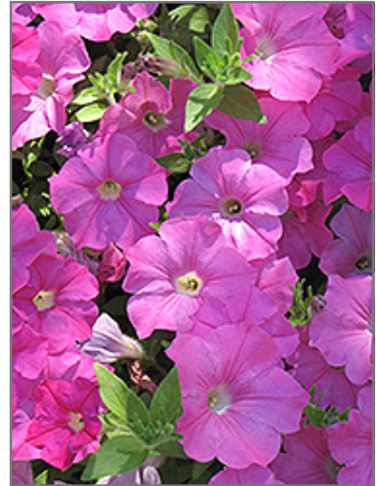
Easy Wave Pink Petunia flowers

Easy Wave Pink Petunia is a dense herbaceous annual with a trailing habit of growth, eventually spilling over the edges of hanging baskets and containers. Its medium texture blends into the garden, but can always be balanced by a couple of finer or coarser plants for an effective composition.