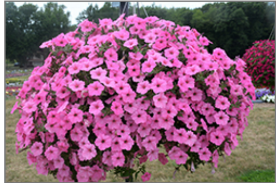
Supertunia Vista Bubblegum Petunia in bloom

Supertunia Vista Bubblegum Petunia will grow to be about 18 inches tall at maturity, with a spread of 24 inches. When grown in masses or used as a bedding plant, individual plants should be spaced approximately 20 inches apart. Its foliage tends to remain dense right to the ground, not requiring facer plants in front. This fast-growing annual will normally live for one full growing season, needing replacement the following year.