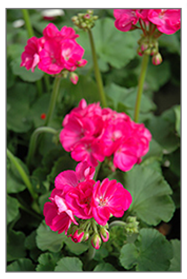
Patriot Rose Pink Geranium flowers

Patriot Rose Pink Geranium features bold balls of lightly-scented rose flowers at the ends of the stems from late spring to early fall. The flowers are excellent for cutting. Its tomentose round palmate leaves remain green in color with prominent brown stripes throughout the year.