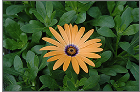
Orange Symphony African Daisy flowers