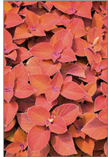
ColorBlaze Sedona Sunset Coleus foliage