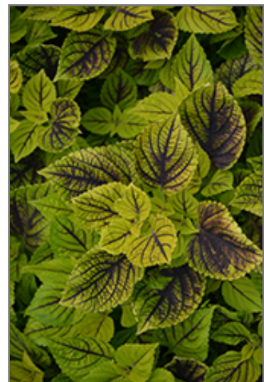
Gays Delight Coleus foliage