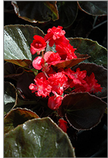
Doublet Red Begonia flowers