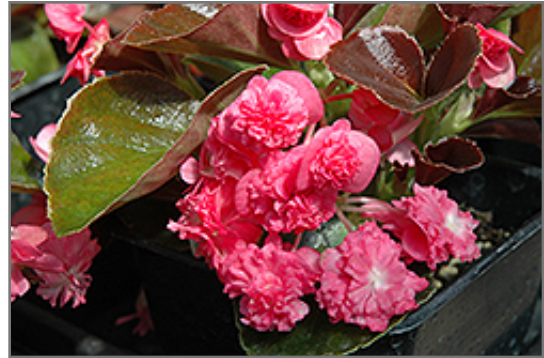
Doublet Rose Begonia flowers