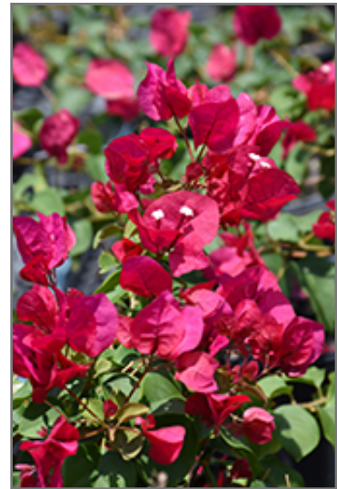
Barbara Karst Bougainvillea flowers