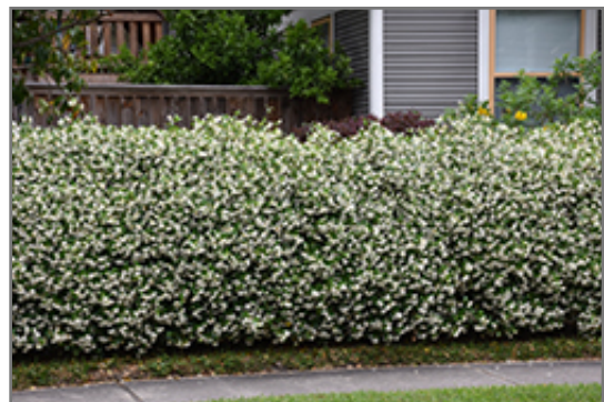
Confederate Star-Jasmine in bloom