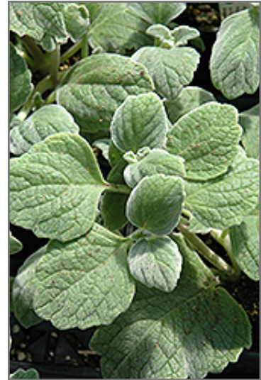
Nicoletta Swedish Ivy foliage