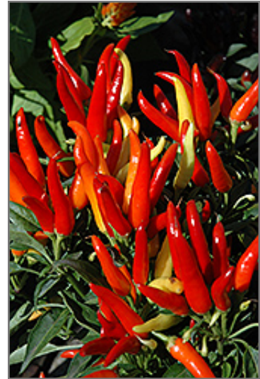
Chilly Chili Ornamental Pepper fruit

Chilly Chili Ornamental Pepper is an herbaceous annual with an upright spreading habit of growth. Its medium texture blends into the garden, but can always be balanced by a couple of finer or coarser plants for an effective composition.