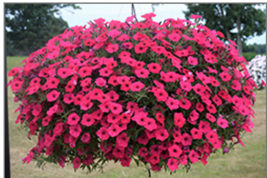
Supertunia Vista Fuchsia Petunia in bloom