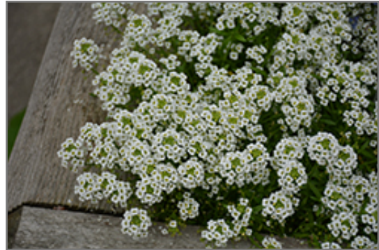
Snow Princess Alyssum flowers

Snow Princess Alyssum is recommended for the following landscape applications;