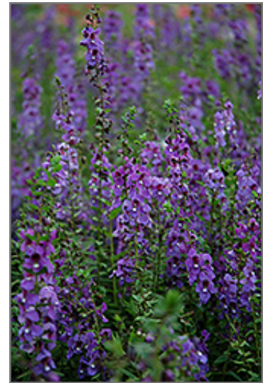
Serena Blue Angelonia flowers

Serena Blue Angelonia is recommended for the following landscape applications;