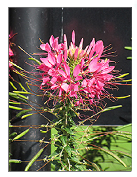
Rose Queen Spiderflower flowers

Rose Queen Spiderflower is recommended for the following landscape applications;