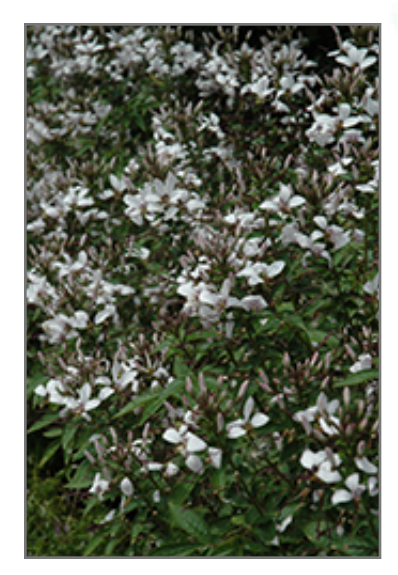
Senorita Blanca Spiderflower flowers

Senorita Blanca Spiderflower is an open herbaceous annual with a rigidly upright and towering form. Its medium texture blends into the garden, but can always be balanced by a couple of finer or coarser plants for an effective composition.