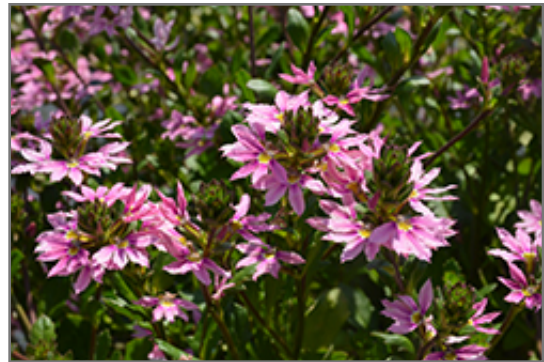
Bombay Pink Fan Flower flowers

Bombay Pink Fan Flower is recommended for the following landscape applications;