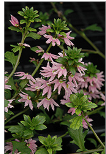
Bombay Pink Fan Flower flowers