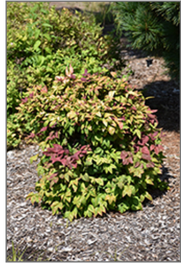
Blush Pink Nandina

Blush Pink Nandina makes a fine choice for the outdoor landscape, but it is also well-suited for use in outdoor pots and containers. It can be used either as 'filler' or as a 'thriller' in the 'spiller-thriller-filler' container combination, depending on the height and form of the other plants used in the container planting. It is even sizeable enough that it can be grown alone in a suitable container. Note that when grown in a container, it may not perform exactly as indicated on the tag - this is to be expected. Also note that when growing plants in outdoor containers and baskets, they may require more frequent waterings than they would in the yard or garden.