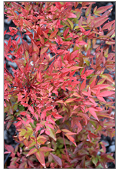
Obsession Nandina foliage