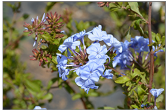
Imperial Blue Plumbago flowers

Imperial Blue Plumbago is recommended for the following landscape applications;