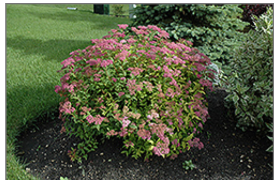
Goldflame Spirea in bloom