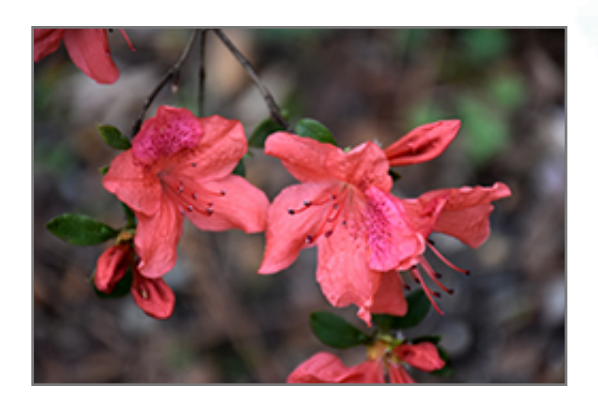
Formosa Azalea flowers