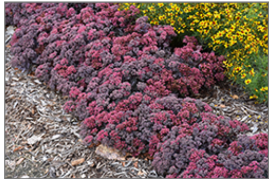
Dazzleberry Stonecrop in bloom