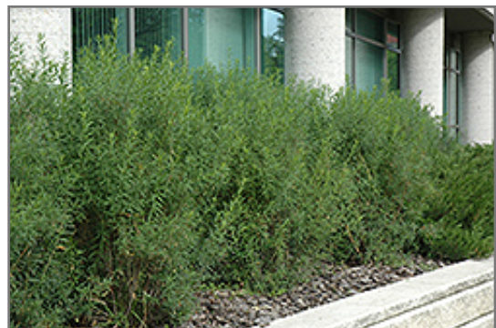
Dwarf Turkestan Burning Bush