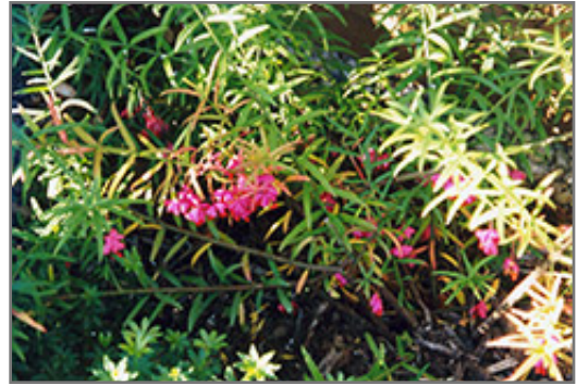
Dwarf Turkestan Burning Bush flowers

This shrub performs well in both full sun and full shade. It is very adaptable to both dry and moist locations, and should do just fine under typical garden conditions. It is not particular as to soil type or pH. It is highly tolerant of urban pollution and will even thrive in inner city environments. This is a selected variety of a species not originally from North America.