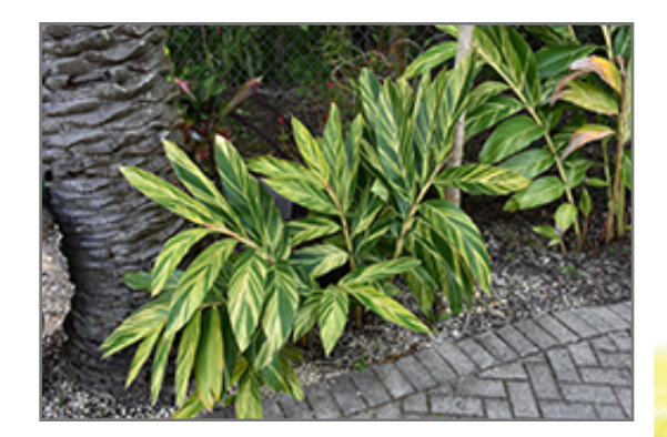
Variegated Shell Ginger