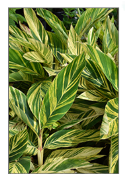
Variegated Shell Ginger foliage